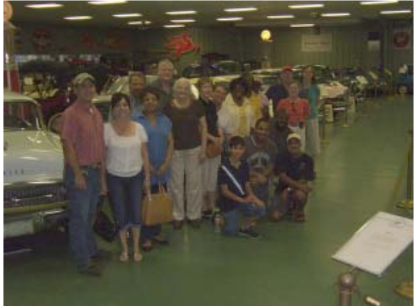
Members of the Houston and Lone Star Sections at the Central Texas Museum of Automotive History