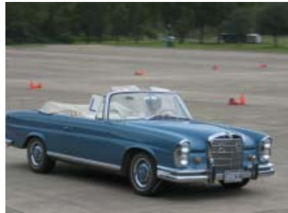
Most of all, good tire screeching fun!