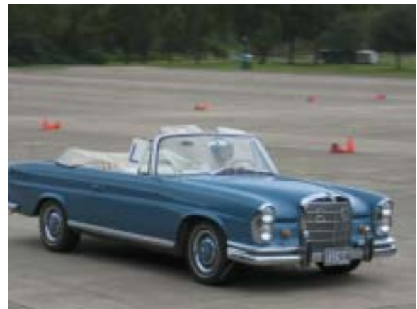
Most of all, good tire screeching fun!