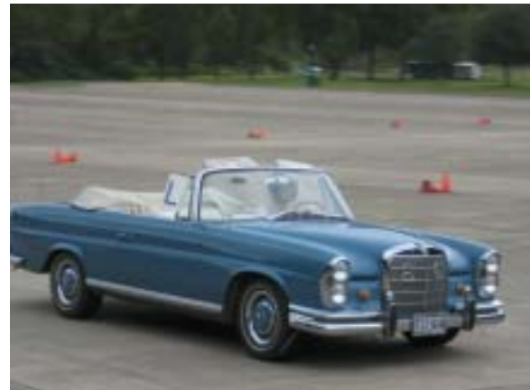
Most of all, good tire screeching fun!