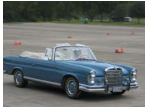
Most of all, good tire schreeching fun!