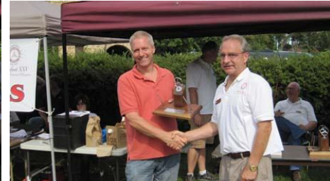
Best Modern Street Car, Classic Motorsports