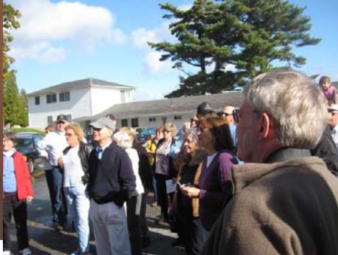
Final instructions before starting out