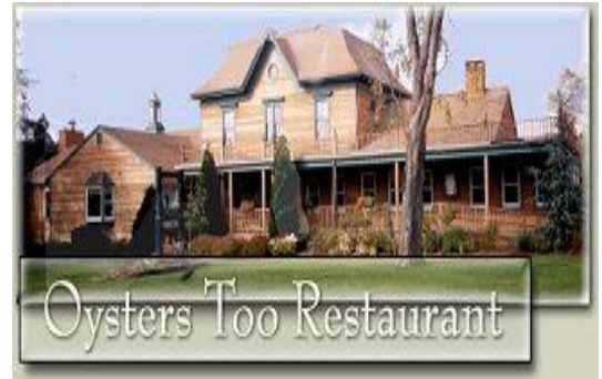
Oysters Too Restaurant

Our 2010 annual nautical cruise will revisit Falmouth and the schooner Liberté we so enjoyed last year. We will depart from the pier located behind the Clam Shack at 227 Clinton Ave. Falmouth, MA on Sunday, August 8th . Free parking is available in the Clam Shack's parking lot. The Liberté , a 74' three-masted