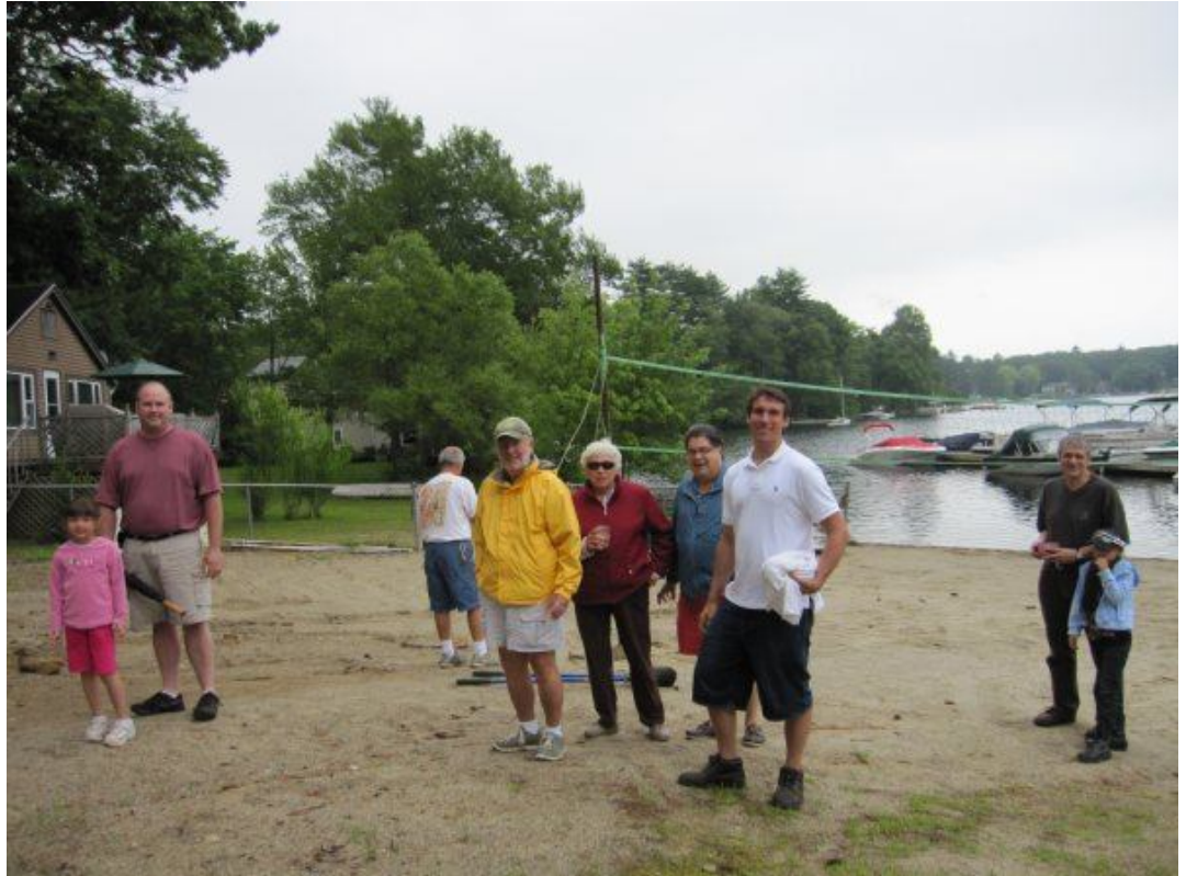
Hardy revelers returning from their cruise around the lake