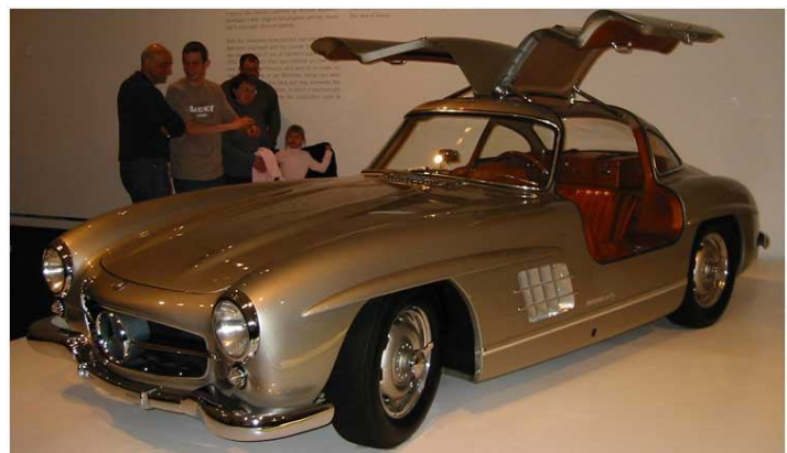
One of the greatest cars ever made: The 300SL Gullwing.