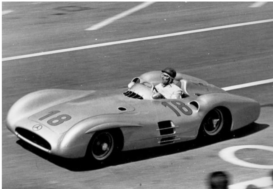
Juan Manuel Fangio (June 24, 1911 – July 17, 1995)