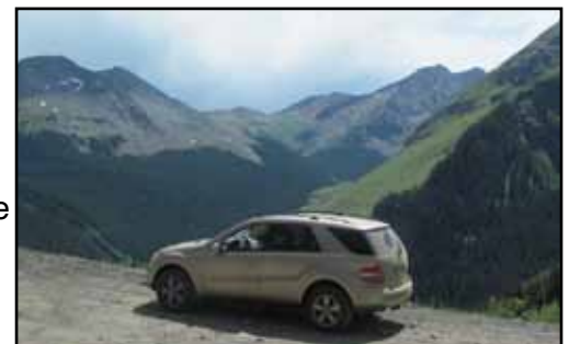
ML On the Edge