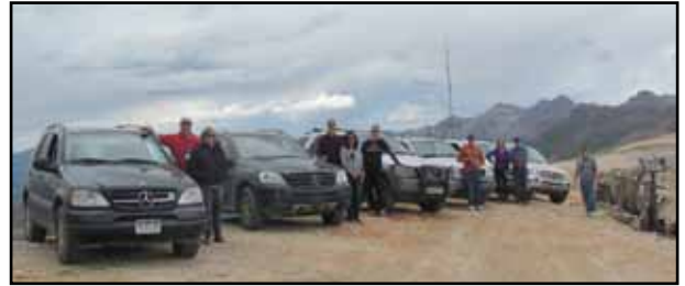
Atop Imogene Pass