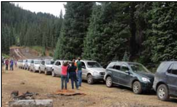
Mercedes Off-Road Proving Ground

For the blues, it was off on the Red Mountain Trail to Corkscrew Gulch. We snaked our way up to Hurricane Pass and on to California Pass with many photo stops along the way. Flatlanders were gobsmacked by the views and the drop-offs but everyone managed to stay on the road and complete the trail. The red team headed off to Mineral Basin and Oh Point for some more difficult trail driving.