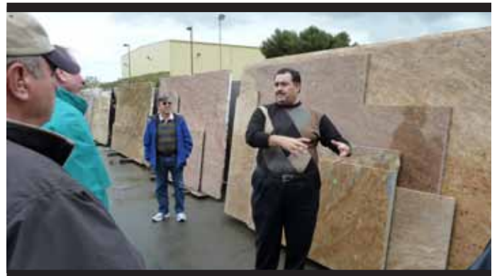
So many granite slabs to choose from at Duracite.