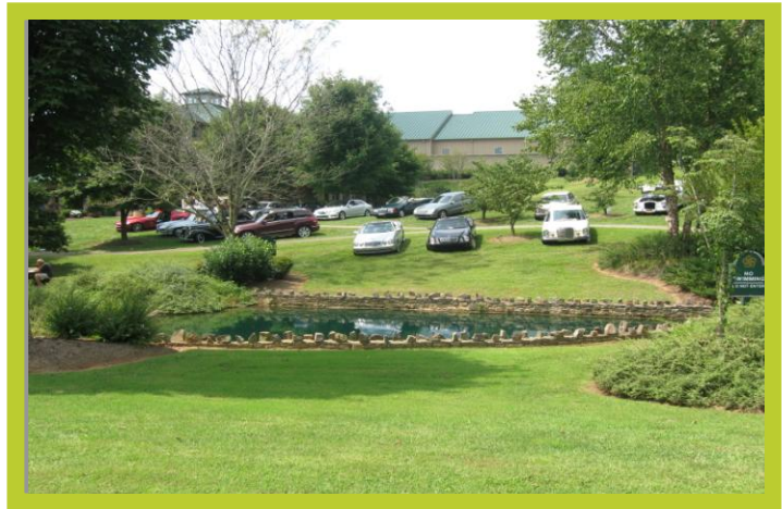
2010 Shelton Vineyard and MBCA car show!